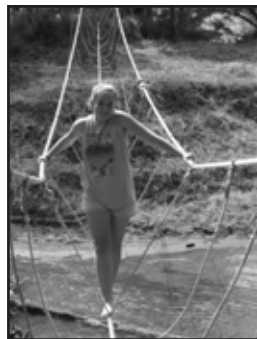
A summer camper tries out one of the new Monkey Bridges.

Check out the Camp website for information and to make your reservations.