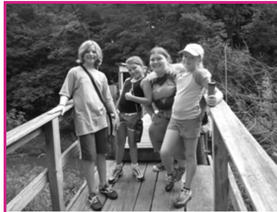
The Swinging Bridge is always popular with campers and staff alike!